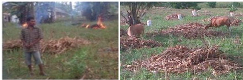
Figure 2. The left is huskcorn attached to stalk being fodder for cow and the right is burnt

The result of interview from respondents who stated that there was mostly cornhusk only corn as fodder for cow. If the land will be planted then the cornhusk still attached to stalk burned (Figure 2).