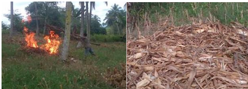
Figure 3. Left is unutilized corn straw and right is corn straw burned because the land will be processed to be replanted (Photo: Halid-Boalemo, July 2014)

Straw as well as husk corn that has not been fully utilized. Even burnt away (Figure 3)