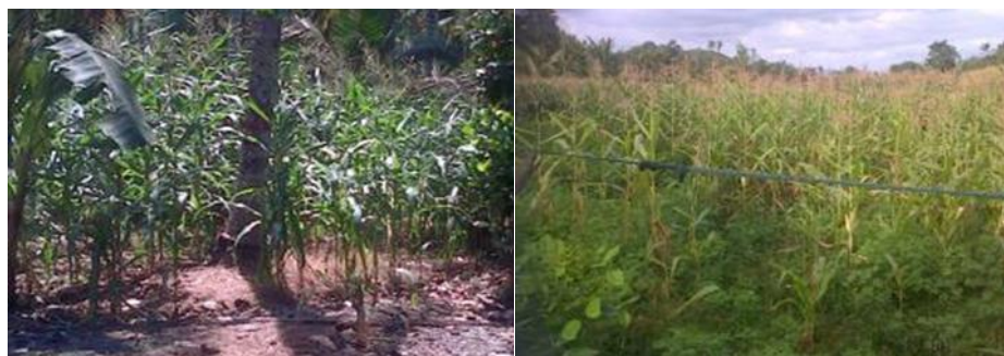
Figure 4. Maize Tebon (Photo: Halid-Boalemo, July 2014)