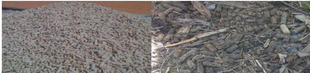
Figure 1. The left is new corncob and the right is corncob wasted This is not utilized. (Photo: Halid-Boalemo, July 2014)

Based on the finding in field that corncob is many untapped, wasted away. Only a few of housewife exploit the corncob as a substitute for firewood. Many corncobs are wasted away (Fig 1).