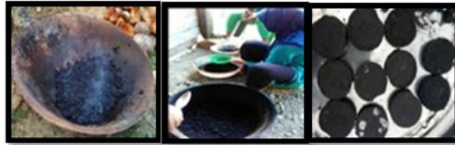
Figure 6. Brikette Charcoal Cob Corn