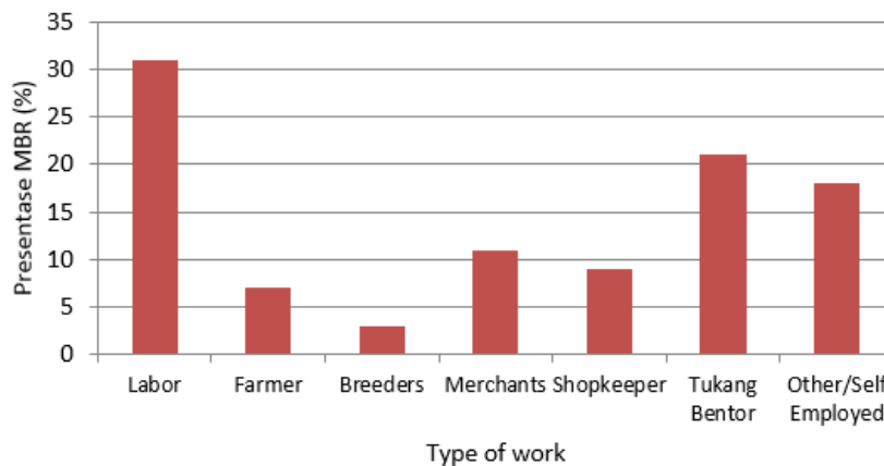
Figure 2. Percentage of Type of Work for Low-Income Communities in Gorontalo City