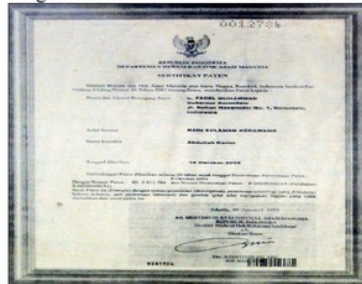
Figure 1: Patent Certificate of Karawo