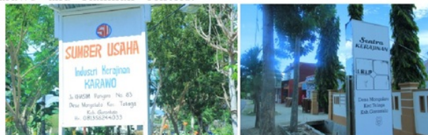
Figure 3 Karawo Centers

One of the government policy and BI is through institutional regulation to ease the process of supporting the karawo crafters by establishing small crafting centers in several potentials areas. Each center has in average 10 to 30 karawo crafters with one person acts as its coordinator. The karawo center was initially in Tapa sub-district, currently, there are several other areas have been established as karawo centers in the district and city of Gorontalo. The biggest center is in the district of Gorontalo with many crafters as its members. Among these centers are "Sumber Usaha Karawo" and "Rahmah" centers.