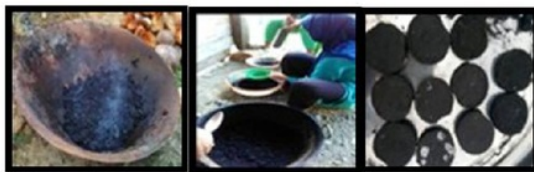
Figure 6. Brikette Charcoal Cob Corn