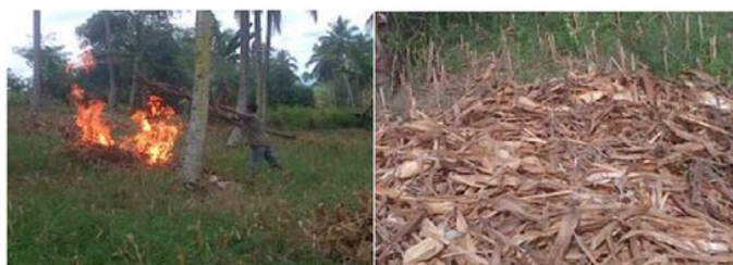
Figure 3. Left is unutilized corn straw and right is corn straw burned because the land will be processed to be replanted (Photo: Halid-Boalemo, July 2014)

Straw as well as husk corn that has not been fully utilized. Even burnt away (Figure 3)