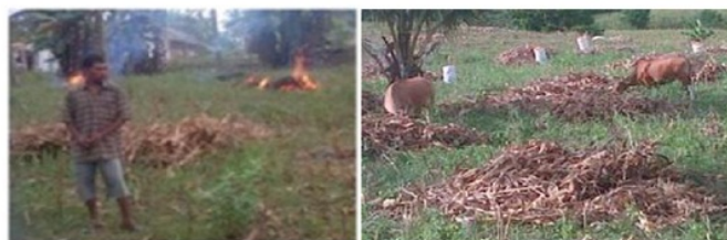
Figure 2. The left is husk corn attached to stalk being fodder for cow and the right is burnt

The result of interview from respondents who stated that there was mostly corn husk only corn as fodder for cow. If the land will be planted then the corn husk still attached to stalk burned (Figure 2).