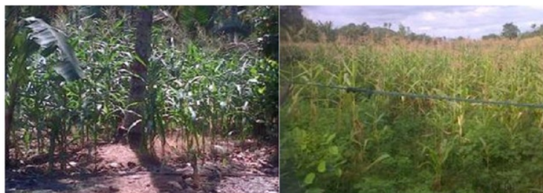
Figure 4. Maize Tebon (Photo: Halid-Boalemo, July 2014)