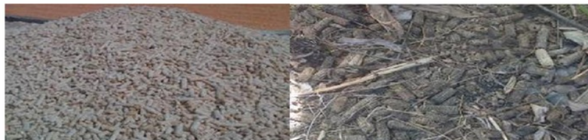
Figure 1. The left is new corn cob and the right is corn cob wasted This is not utilized. (Photo: Halid-Boalemo, July 2014)

Based on the finding in field that corn cob is many untapped, wasted away. Only a few of housewife exploit the corn cob as a substitute for firewood. Many corn cobs are wasted away (Fig 1).