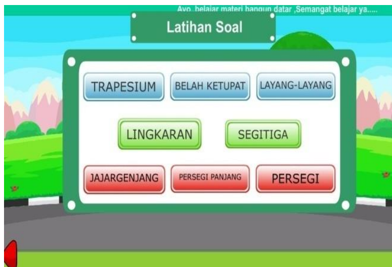
Figure 3: Interface of practice test sub-menu

The practice test sub-menu contains questions to be solved in order to measure the students' comprehension of the learning material. The practice tests in the multimedia are formulated by referring to the indicators of learning objectives achievement. Further, the interface of practice test questions is displayed as follows.