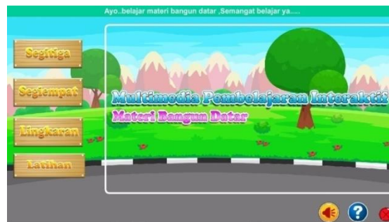
Figure 1: Main menu interface

The initial stage of the research is to develop adequate and quality learning multimedia of two-dimensional shape by employing a 4-D model. The multimedia consists of four main components, i.e., triangle, rectangle, circle, and practice test; thus provides an ease to the teachers in delivering learning material on two-dimensional shapes and to the students in learning independently. The multimedia user interface system is made with a user-friendly approach for the students to interact with since it is featured with an attractive display of information packaged in concrete and concise concepts in the form of audio and images. The features aid the students in creating a fun and enjoyable setting during processing information, therefore, stimulating their interest in interactive objects displayed in the multimedia. As the user, students are handed full control to choose whichever topics to be learned, to solve the practice tests available, and to find out their test result.