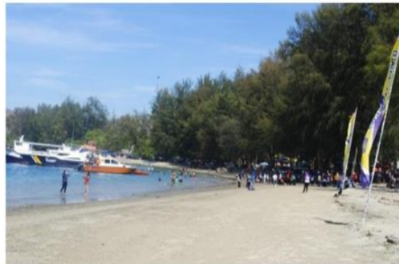
Picture 1. Bolihutuo Beach

At the time of the trip, visitors will pass through the green scenery of Boalemo Regency accompanied by cool air and hilly valleys. Palm trees are scattered among green hilly terrain and line the beach, giving these 38 areas a calm and relaxed atmosphere. This is a great place to come if looking for relaxation and a break from the hectic routine of everyday city life.