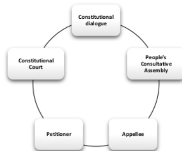
FIGURE 2 ILLUSTRATION OF THE SECOND SCHEME II

The second scheme offered by the author is that the MPR interpretation mechanism is passive one. In this case the court is able to inquire the MPR to provide space for interpretation of a constitutional product that the Constitutional Court. The referred interpretation is an interpretation based on the constitution or the 1945 Constitution, in the event of the applicant argues that the application is based on the 1945 Constitution, then the MPR is able to provide an interpretation of the meaning, intent, and purpose of the onset of the formulation of the article argued by the petitioners to the Constitutional Court. The following is an illustration of the second scheme (Figure 2):