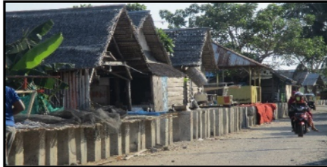
Figure 5: Permanent house 17 Fisherman in Pohuwato and Pohuwato Timur