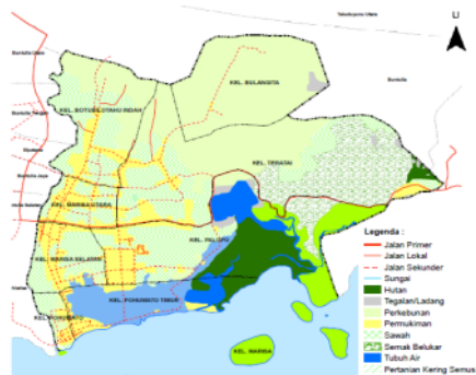
Figure 6: Research Site Map