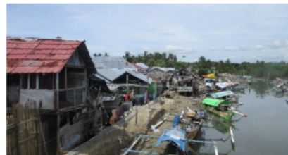
Figure 8: Houses with mooring