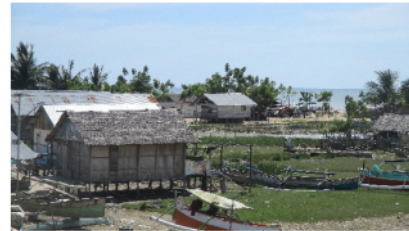
Figure 7: Simple fishermen's settlement in Pohuwato Village and Pohuwato Timur Village

protection) to keep the settlement area from abrasion and rob flood.