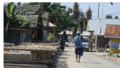
Figure 9: Condition of roads