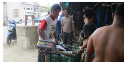
Figure 2: Fishermen's Activities in Pohuwato Village and Pohuwato Timur Village