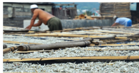
Figure 3: Fishermen's Activities in Drying the Fish