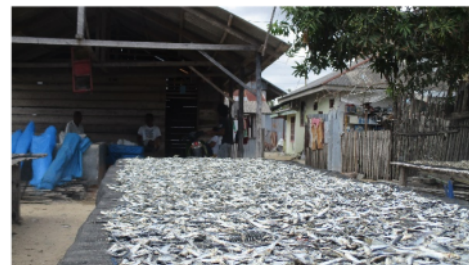
Figure 1: Fish Drying

As many as 1.5 to 2 tons of the catch are distributed to the traditional market in Marisa and Paguat for fulfilling the food supply of the population in the cities and nearby areas, while 3 tons of the catch is sold to the markets in the city center in Bitung, Gorontalo, Palu, and even to other islands, such as Kalimantan to earn more income for the community in Marisa city. Should the fishermen want to land their catches from their boat to the coastal area, they have no choice but to rent a smaller boat because the port in the area does not meet the standard.