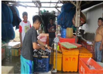
Figure 4: Fishermen's Activities in Scaling the Fish