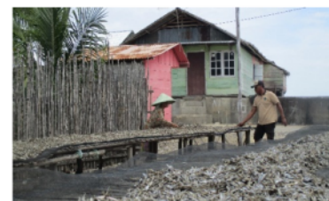
Figure 10: Daily activities of the fishermen

Two scoring methods were employed to determine the living conditions in the fishermen's settlement in the studied villages. Table 2 demonstrates the criteria and indicators of the slum area, along with its scoring, prepared by the Directorate General of Human Settlements