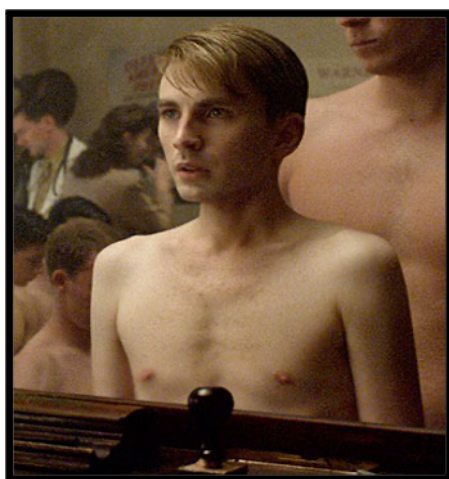
Figure 1. The Small and Frail Steve Rogers