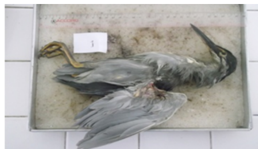
Figure 2: Butorides striatus .