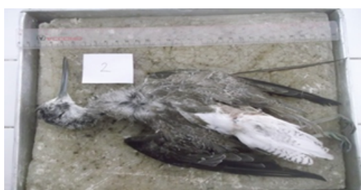
Figure 4: Actitis hypoleucos .