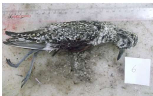
Figure 5: Pluvialis squatarola .

and Pluvialis squatarola 0.11 ppm. In the liver, the largest mercury exposure is still on the bird species of Tringa melanoleuca 0.31 ppm, Actitis hypoleucos 0.18 ppm, followed by Butorides striatus 0.17 ppm, and Pluvialis squatarola 0.10 ppm. Mercury is also exposed to the chest muscle tissues of birds, Tringa melanoleuca still the largest exposure of mercury in muscle of 0.31 ppm, for Butorides striatus 0.12 ppm, then the Actitis hypoleucos and Pluvialis squatarola exposed to mercury in their muscles 0.10 ppm, respectively.