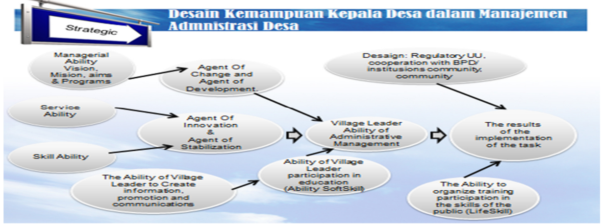
Scheme 1: The Design Strategy of the Village ChiefCapacity