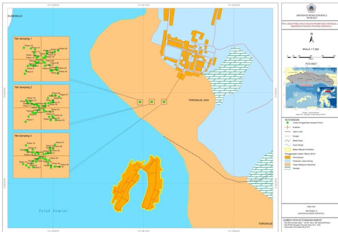
Figure 1. The study site in the coastal region of Torosiaje Jaya Village, Gorontalo, Indonesia

Each plant is contained in the quadrant, recorded the name of the species. Measured the diameter of the tree is calculated based on diameter at breast height (dbh) of 1.3 m above the ground or above the buttresses, while the total tree height is calculated from the above buttress without counting the canopy. Furthermore, in calculating the density of the wood. Mangrove species that cannot be identified in the field, that it was taken instance leaves, fruits, and flowers to be made herbarium and further identified in the Laboratory of Botany, Universitas Negeri Gorontalo, Indonesia. In addition to data mangrove species, also measured the temperature, salinity, soil pH, and moisture.