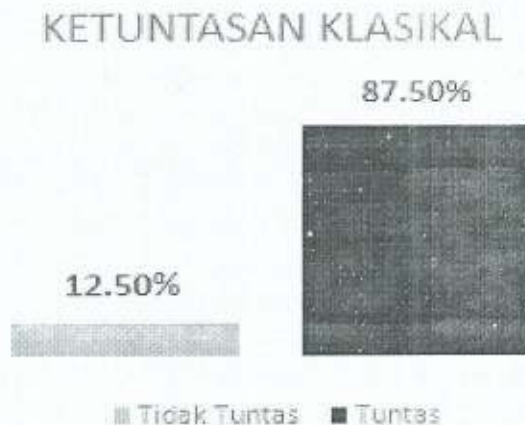
Figure 2. Classic mastery

To measure students' learning outcomes, researchers used the test result as an instrument in the form of test. Posttest is given at the end of the learning process which was during 2 meetings by applying the steps of local wisdom-based learning. After the local wisdom-based wisdom learning applied to the test class, 12.5% is incomplete and 87.5% complete. Data result of classical completeness SMP Negeri 1 Tapa students shows in Figure 2.