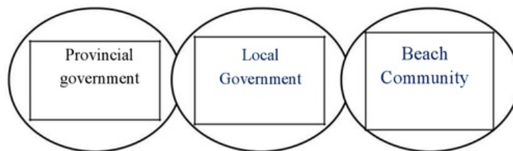
Figure 1: Management Synergy Botubarani Beach Management Strategy

The real effort of the government in the protection of whale sharks as a center of ecotourism is through the concept of coastal management design, which is still awaiting official regulation from the Government. However, the community still refers from the Regional Regulation and refers to the Central Bureau of Statistics for the development plan of the city system in Bone Bolango. It is organized by the Center for Environmental Services to improve the services of inter-village scale activities, with the objectives of the development plan being Kabila Bone as can be seen in the growth of various development sectors in high priority as part of the Bonebolango area.