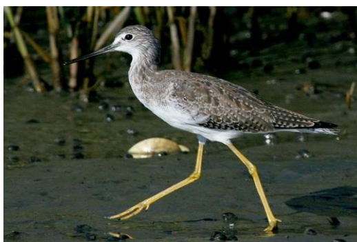
Fig. 3 Tringa melanoleuca

This species known as Sandpipers, included in the family of Scolopacidae and genus Tringa. Sandpipers is a kind of waterbird eatis crustaceans, insects and invertebrates that live in coastal waters and estuaries. Results of the analysis of mercury in the kidneys of Tringa melanoleuca 0,43 ppm, liver 0,31 ppm, and the muscle 0,31 ppm. (see Fig. 3)