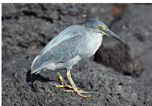
Fig. 2 Butorides striatus

This species included in the family of Ardeidae and genus of Butorides, the local name known as Kokokan (local name: Tou). This birds eats the fish, insects, and shrimp in coastal habitats, estuaries and ponds. Usually, this species fly foraging alone, sitting on a rock or the edge of the embankment of water while waiting for prey. Based on the analysis of mercury obtained in the kidneys of Butorides striatus that is 0,22 ppm, liver 0,17 ppm, and muscle 0,12 ppm. (see Fig.2)