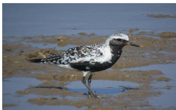
Fig. 5 Pluvialis squatarola

This species known as a big pot included in the family of Charadriidae and genus pluvialis . This waterbird eats invertebrate in muddy and sand habitat in the tidal area, usually foraging in small groups. Based on the result of laboratory analysis, that the exposure of mercury in the kidneys of Pluvialis squatarola 0,11 ppm, liver 0,10 ppm, and the muscles 0,10 ppm. (see Fig.5).