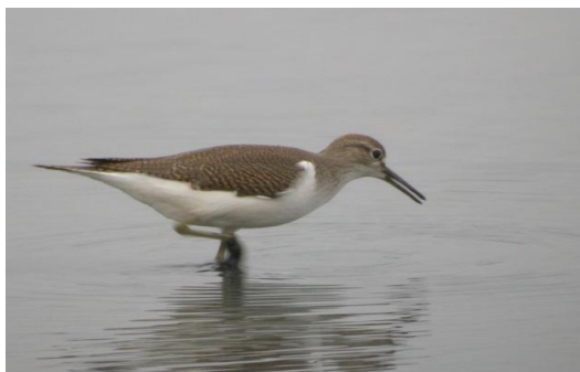
Fig. 4 Actitis hypoleucos

This species included in the family of Scolopacidae and the genus Actitis . Actitis hypoleucos known as Sandpipers, a species of waterbird eats crustaceans, insects and other invertebrates that live in sand habitats, mud and estuaries. Results of the analysis of mercury in the kidneys of Actitis hypoleucos 0,19 ppm, liver 0,18 ppm, and the muscles 0,10 ppm. (see Fig.4).