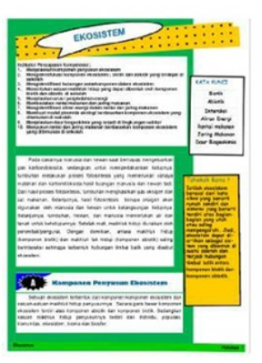
Figure 2: The Introductory Section of Teaching Material

Figure 1 shows that teaching materials are designed to meet the needs of learners based on the results of the initial learner analyses. The background on the cover of the teaching material uses a picture from the forest of Meja Mountain. This forest is behind the campus of University of Papua. The lecturer often uses it for animal and plant ecology practicum activities. This background is used to further introduce the existing ecosystem around the student's residence. The Nepenthes plants used are native plants located in the Botak Mountain of Manokwari. The bird used is a native Papuan bird, documented in person at the time of practicum activity on the island of Biak. To reduce the basic understanding gap of students to nature, different sources of information are needed [20,21]. This information is detailed on the cover and concerns the diverse nature of Papua. This can be used by the teacher as a reference to introduce the students to their natural surroundings.