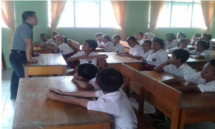
Figure 1. Implementation Readiness Student Learning in Multicultural Learning Model b . Habituation Values and Cultural Understanding