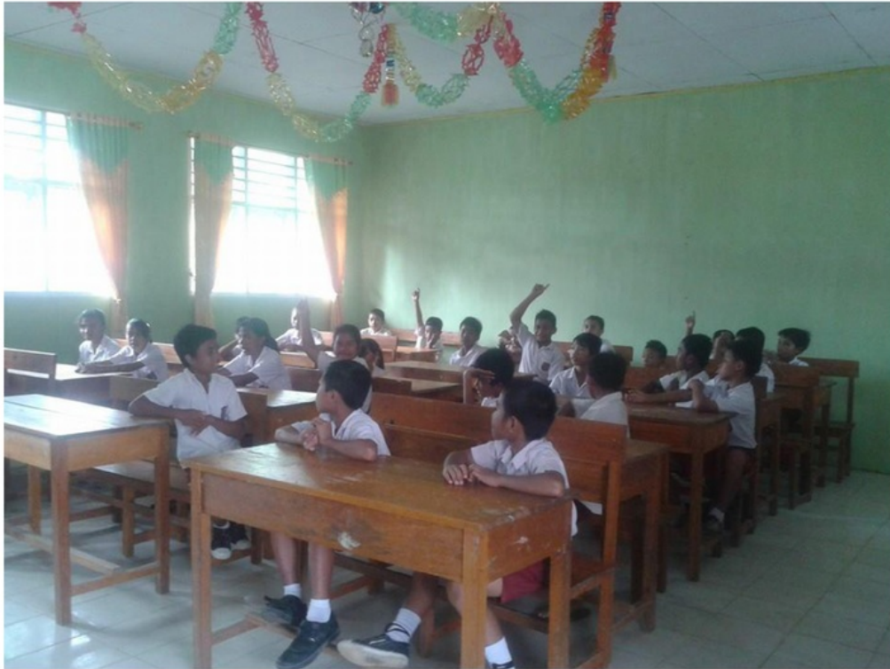
Figure 2. Response Students in Habituation Planting Activity Plan

Habituation grow up on student participation in activities such as preparing container planting, prepare the seedlings, maintenance , measurements of growth and development , and the harvest.