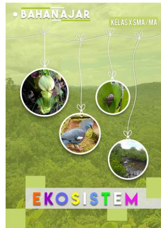
Figure 1: Front Cover of Teaching Material

The teaching materials developed in this research focus on ecosystem material. The results of the design and validation of said teaching materials by experts are shown in Figures 1 and 2 as follows: