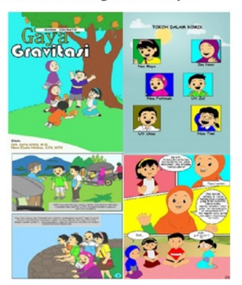
Figure 1. The Gravity Comic

The development of comic as learning media for natural science subject in gravity topic was preceded by designing the comic. In general, it contains the gravity materials including the notion of gravity, the benefits of gravity, and object motion due to the gravity. The materials are delivered in a simple way and supported by interesting drawings and cultural contents such as Gorontalo historical attractions, Otanaha Fortress, traditional transportation of Bentor, and Gorontalo's traditional house of Dulohupa. In addition, the characters are named after native Gorontalo names for girls and boys.