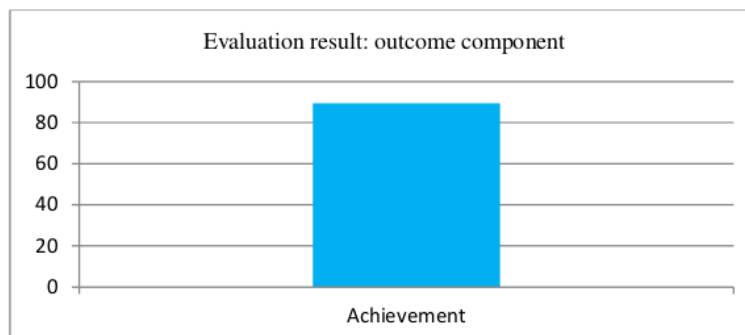
Figure 3 Outcome component evaluation result

From the above result, it is revealed that the actualization of the outcome component of Adiwiyata Mandala program is mostly well-implemented. The result is provided in the following chart: