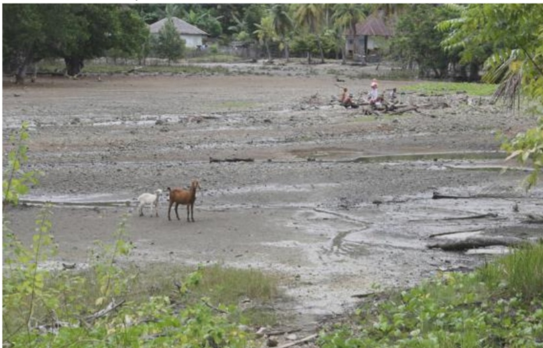
Figure 2. Coral and Sand Mining Activity in the Site Object despite its Potential to be a Farming Site

In fact, the area is potential to be a centre for integrated farming and agricultural area.