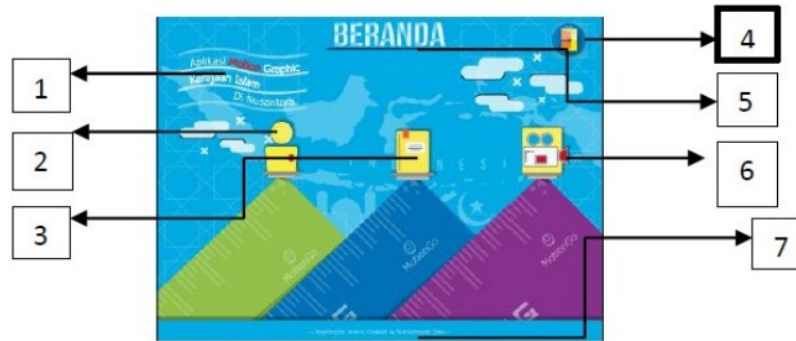
Figure 2. Design homepage