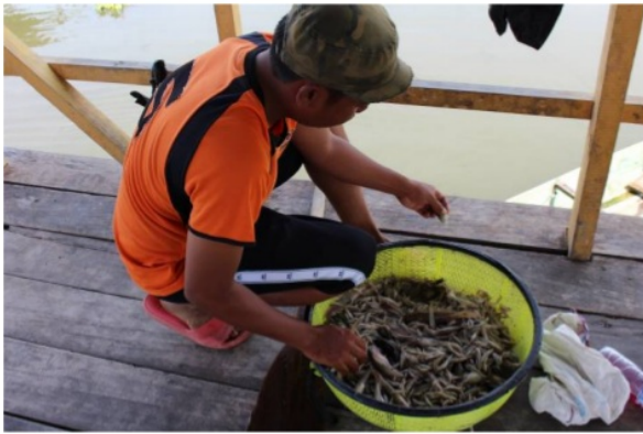
Figure 5. One boat with 2fishers departed from small port at Hutadaa Village at night and came back here late morning. They caught manngabai by net. Fishes in yellow colander is outcome for a night. There are few fish catches this time, but always they can catch 2-3times of this. December 2017.

Fishers in Ilotidea Village can catch nila and mujair with rod and string. In Hutadaa Village, fishers used net to catch manngabai. They sell fishes to fish seller at bay of village. They sell fishes to fish seller. Basic data and estimation of fisher's economic situation show at Table 2. Because quantity of fishes is different each day and season, this result is approximate calculation. The minimum and the maximum have over triple difference. But we can guess that estimation of fisher's earnings is Rp.51,583,000-155,750,000/year and person.