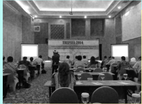
— TREPSEA 2014

We are expanding the area to environmental problems and current contributions to have more growth for international conference on the matter of environmental problems. We believe that you definitely have interesting for joining it. The International conference of the Transdisciplinary Research on Environmental Problems in Southeast Asia (TREPSEA) aim to conduct integrative research of interactions between natural environment and human-social systems in Southeast Asia to solve the environmental problems in Southeast Asia. Its scope thus includes topics of geoscience, environmental science, engineering, medicine, economy, culture, education, and administration.