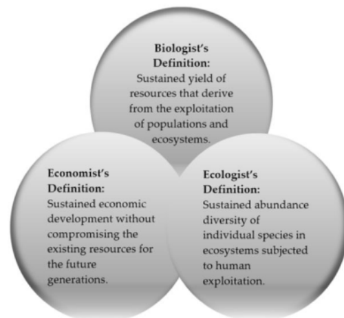
Figure 1: Sustainability

Sustainability has picked up as much significance as the board in business. Sustainable pavement improvement as a business practice ought to include making assessments as per the triple primary concern in the asphalt life-cycle. In spite of the present ways to deal with assessing the social just as monetary and ecological plausibility of pavement projects, there has as of late been an absence of accord on a system to ensure sustainability upon evaluation and examination during the life-cycle of pavement.