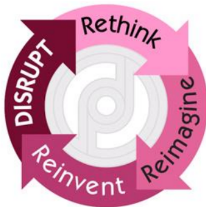
Figure 3: Cycle of Disruption

The Forum for the Future report communicates significant worry for jobs in creating nations, as automation in assembling and farming replaces employments. As in the created world, individuals in creating countries should prepare in new aptitudes for new occupations.