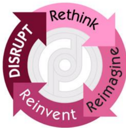
Figure 3: Cycle of Disruption

The Forum for the Future report communicates significant worry for jobs in creating nations, as automation in assembling and farming replaces employments. As in the created world, individuals in creating countries should prepare in new aptitudes for new occupations.