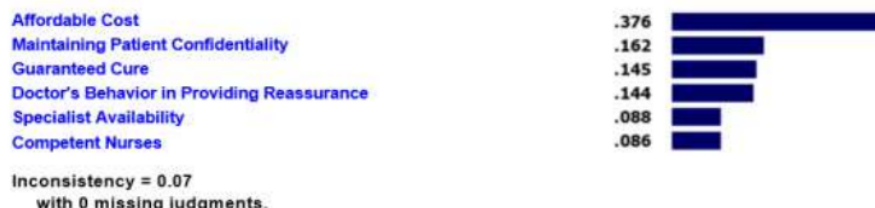
Figure 3.5 AHP Analysis Results of Interest Weight of Assurance

Out of the six indicators of assurance, the highest priority is affordable cost weighing 0.376. This indicates that this becomes an issue that Regional General Hospitals in Gorontalo should devote most attention to. Many patients complain about the unaffordable costs uncovered by Health Care and Social Security (BPJS) or other insurances. Therefore, hospitals need to consider patient's financial ability as this indicator is the most important to pay attention to.