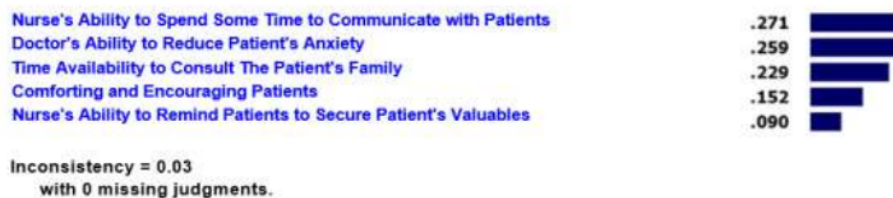
Figure 3.6 AHP Analysis Results of Interest Weight of Empathy

Goal: Service Quality Model of Regional General Hospitals in Gorontalo >Empathy