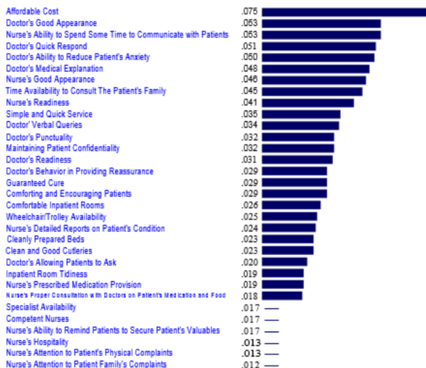
Figure 4.6. AHP Analysis Results on Weight of Interest for All Indicators

The weighted output of all indicators indicates that affordable costs is crucial as it weighs of 0.075 followed by doctor's good appearance by 0.053. The third priority is that nurses could take special time to communicate with patients (0.053), followed by doctor's quick respond (0.051). The fifth order is doctor's ability to reduce patient's anxiety (0.050). The sixth priority is doctor's medical explanation (0.048). The seventh priority is nurse's good appearance (0.046). The eighth priority is time availability to consult the patient's family