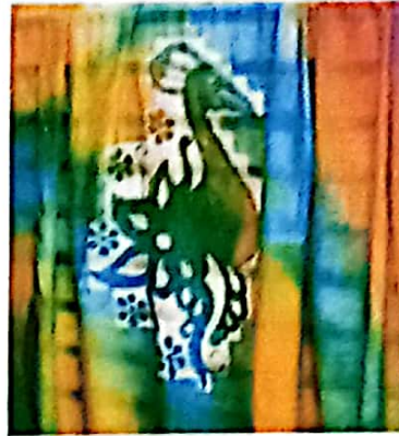
Figure 5. Results of Karawo Embroidery Innovation with Batik Technique