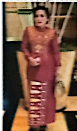
Figure 3 . Karawo Embroidery with Amethyst Motifs on Traditional Women's Clothing in Gorontalo

The application of motifs that carry the theme of tradition as a strengthening of regional character and contemporary creative motifs in order to bring local art closer to the wider community, especially the younger generation. This motif variation is the implementation of adaptation and expression as well as a marker of traditional and modern motifs (Sawanti, 2018). The contemporary themes are taken from something that is becoming a trend, from depicting the lifestyle of modern society to social media icons or booming themes. The