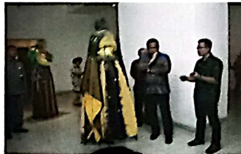
Figure 6. Exhibition at the National Gallery of Jakarta