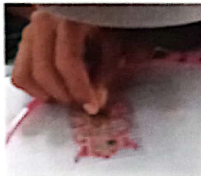
Figure 2. The Process of Making Karawo Embroidery Motifs