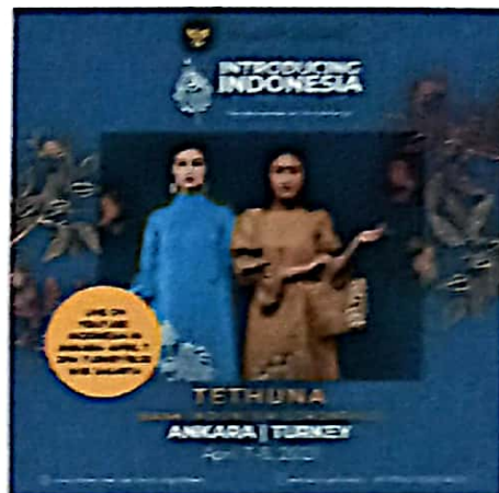
Figure 7. A Hybrid Fashion Event in Turkey