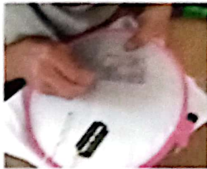
Figure 1. The Process of Slicing Fabric Fibers Before Filling with Karawo Embroidery Motifs