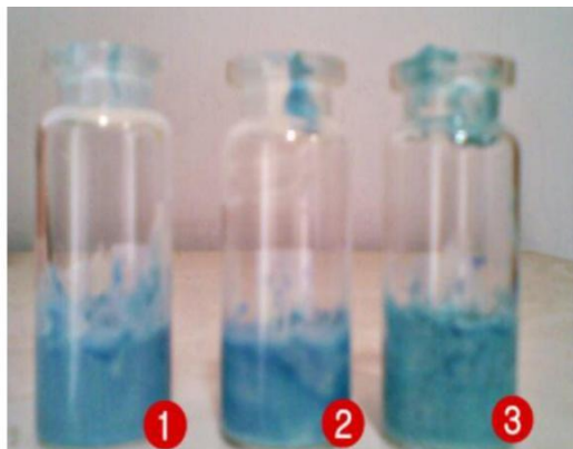
Fig. 2 Emulsion type test with color dispersion method

This describes three formulas of cream contain the amount of water more on an external phase, which is based on the external phase in emulsion. Meanwhile, color dispersion method showed that all formula cream gave blue color from blue methylene (Fig.2). It is caused by the amount of water more in formulations so that blue methylene is easy to dissolve in the water phase and is able to color all creams.