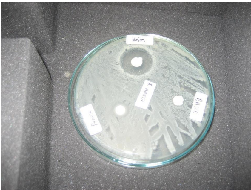
Fig. 5 The inhibition zone of snakehead fish cream 2%

All cream formulations of 2% snakehead fish dry extract with different concentrations can be categorized as physically stable and had antibacterial activity against Bacillus subtilis .