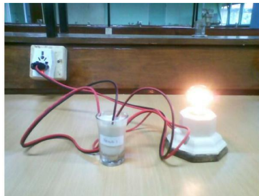
Fig. 3 Emulsion type test with electrical conductivity method

On the other hand, the electrical conductivity method showed bulb can light (Fig.3) because the amount of water more as external phase which is able to conduct electricity. Based on the results of cream type tests can be proved that all creams had emulsion type o/w and showed no inversion phase after stress condition storage.