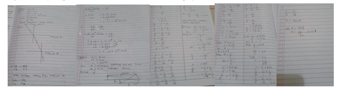
Figure 2. Result of Problem Solving for S1 (T) Subjects

Based on the diagram in Figure 1, the S1 subject managed to achieve a percentage of 100% for the problem focus indicator and the indicator planning solution. This means that from all the questions given, the S1 subject can understand the problem properly and accurately and can describe the mathematical problem correctly. The indicators of implementing the plan and evaluating the completion of the S1 subject reach a percentage of 95%, which means being able to complete the plan and evaluate the completion of the answers well. As for the physical depiction indicators, the S1 subject is still very low where the percentage obtained only reaches 33%, which means that of the 5 questions given only 2 questions can be described in full physics.