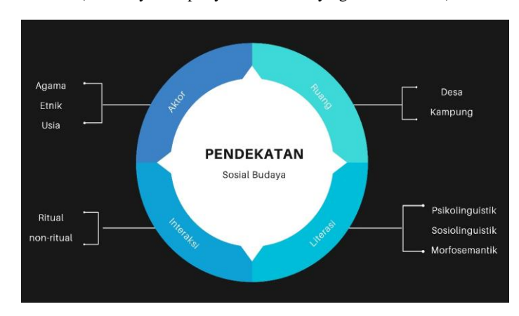
Figure 2. Covid-19 Mitigation Scenarios with a Socio-Cultural Approach

The approach of actors or figures as a strategy is critical because, in Gorontalo ethnic culture, the term "lo 'iyalota'uwa, ta'uwalolo'iya" (the character's words must be followed) is important to provide understanding to the community. At the systematic sub level, the character is a person and has a "value," which becomes the cohesion of the ngala'a. Characters must be "moodelo" (can carry exemplary values in carrying out their roles).