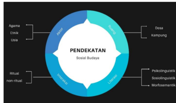
Figure 2. Covid-19 Mitigation Scenarios with a Socio-Cultural Approach

The approach of actors or figures as a strategy is critical because, in Gorontalo ethnic culture, the term " lo 'iyalota'uwa, ta'uwalolo'iya " (the character's words must be followed) is important to provide understanding to the community. At the systematic sub level, the character is a person and has a "value," which becomes the cohesion of the ngala'a . Characters must be " moodelo " (can carry exemplary values in carrying out their roles).