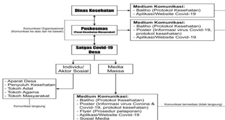
Figure 1. Covid-19 Reliance Village Communication Strategy

In this context, it is necessary to transform government communication in the current pandemic era into public sector risk communication oriented towards public involvement [34]. In building public involvement, it can be started from the smallest community scope, namely the village. Here the role of the Covid-19 Task Force in the village is very strategic. They can be the key in preventing and controlling Covid-19 in an area, especially in Pohuwato Regency, which has various community characteristics. The data shows from an education perspective that primary school graduates (39.3%) are higher than other education levels. The status of being a housewife is the dominant occupation of the community. While the level of public knowledge about Covid-19 is relatively high (54.8%) obtained through mass media (55.4%),