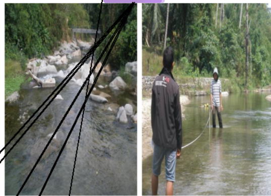
Fig 1. The location of the PLTMH in the village of Main Mongi'ilo

makes sections of this road can not always be traversed by four-wheeled vehicles. Details of construction design survey locations of PLTMH as shown in Figure 1.