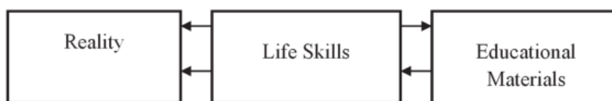
Figure 2. 1: The Correlation between Reality, Life Skills, and Educational Materials