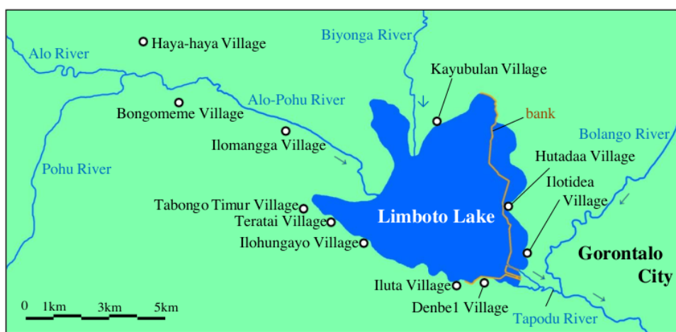
Figure 2. Research Point

Especially to grasp now and past information of water's edge, we interviewed inhabitants who live in the nearest place from water's edge. But inhabitants of Kayubulan Village don't have past information because it is new village established by government of Gorontalo District in 2015. To grasp correct village locations, we used 1:50,000 map that published by Universitas Negeri Gorontalo. After field survey in each village, we measured detail distance by GIS map and data.