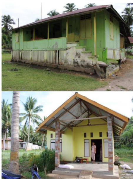
Figure 4. If flood happens, people can save their life on high floor of aboveground house style (upper picture, constructed in 1958 at Tabonogo Timur Village). But nowadays, almost people choice modern style house (below picture, constructed in 2014 at Ilomangga Village) because aboveground house style is more expensive than modern style. Flood continues around 1month over in rainy season, 1m depth water remain around houses. Floor of modern style house is not high from ground, so water come into the house when flood. Family members have to move furniture from first floor of houses that filled water several weeks until water has gone.

Almost of houses near lake are modern styles. Therefore, those entrance and floor are same level or low level near ground, that houses will be flooded. If it is aboveground house style, they can prevent the inundation to their house. But people don't choice aboveground house style, because building cost of house is expensive than modern style (Figure 4).