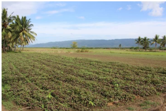
Figure 6. The west part of Limboto Lake is large farmland. But irrigation facilities are not enough. A farmer family who live near Alo-pohu River at Ilomangga Village has 1ha paddy and 0.5ha vegetable farm, and they make rice and several vegetables with only family workers. Because here are no irrigations, to get water they have to wait for rain in dry season. September 2017.

Farmer can earn approximately Rp.10,000,000/year. Red onion is not main earning but it is important for sub economy. Furthermore red onion and other vegetables are suitable for cultivating on little water farm without irrigation system.