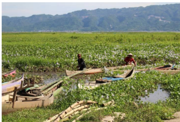
Figure 3. As one of the environmental change, we indicate increasing water hyacinth from around 2000. The bay of village located at water's edge is filled with water hyacinths untill 2km offing. Fishers go to fishing by small boat, they have to row while pushing water hyacinths aside. This picture shows fishers coming back to Kayubulan Village from center of Limboto Lake, December 2017.

One of the causes of the rapidly change of the lake environment is the inflow of sediment. We can guess that a change of plants was caused with it. However, fish farming and electric shocks fishery are direct influence on fish situation. In addition to this, the extinct thing by the indiscriminate catches of the crocodile happened in the past. We must think that human activities have bigger influence on ecosystem.