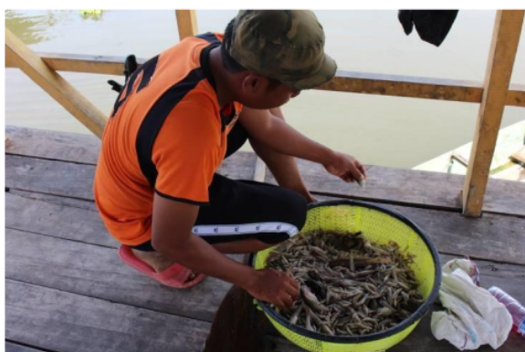
Figure 5. One boat with 2fishers departed from small port at Hutadaa Village at night and came back here late morning. They caught manggabei by net. Fishes in yellow colander is outcome for a night. There are few fish catches this time, but always they can catch 2-3times of this. December 2017.

Fishers in Ilotidea Village can catch nila and mujair with rod and string. In Hutadaa Village, fishers used net to catch manggabei. They sell fishes to fish seller at bay of village. They sell fishes to fish seller. Basic data and estimation of fisher’s economic situation show at Table 2. Because quantity of fishes is different each day and season, this result is approximate calculation. The minimum and the maximum have over triple difference. But we can guess that estimation of fisher’s earnings is Rp.51,583,000-155,750,000/year and person.