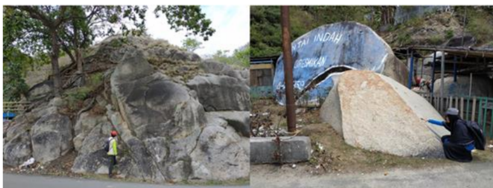
Figure 3. The Pantai Indah granite outcrop and the Lahilote site.

In addition to sand deposits on the marine plains, there are also blocks of granite. Granite boulders are the result of granite weathering in the intrusion hills and are transported to the marine plains. The material for volcanic hills is granite. Volcanic hills are used for infrastructure development, settlements and areas of wild vegetation. See figure 3 below.