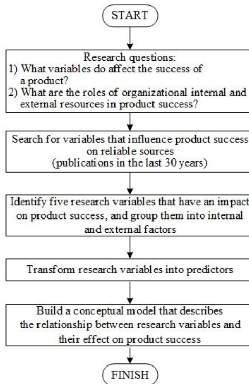
Figure 2. Stages of The Study [9]

One focus of this study is to define successful products, due to the fact that the word “success” has multiple perceptions, and cannot be measured using only one indicator. Product success is impacted by various factors so “the evaluation of the success” of a “product development” must be conducted together with other aspects [11], [12]. Understanding success can also differ between groups involved in “product development”, such as the research & development, production departments, and marketing. In addition, there are still few theoretical studies that differentiate the “indicators of success” from “determinants of success” of a product [13].