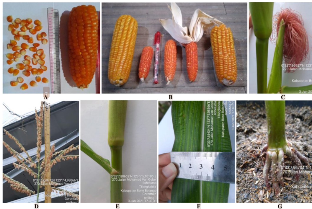
Figure 2. Description of binthe kiki maize variety: A. Corn kernels and cob, B. Comparison between cob of binthe kiki and Bisi-18 hybrid variety, C. Silk of binthe kiki , D. Male flower of the plant (anther), E. Stem and internodes, F. Leaves, G. Roots

The analysis results of the proximate contents of binthe kiki variety are presented in Table 2. The data were obtained from an average of two repetitions. The water and fat contents of binthe kiki variety are lower than the yellow Manado maize kernels. On the other hand, the binthe kiki variety has higher ash content, fiber content, and protein content compared to the yellow Manado variety. A study by Landeng et al. (2017) on yellow Manado maize reported that the moisture content of the variety is at 12.62 \pm 0.31\% , ash news at 2.20 \pm 0.01\% , protein content at 7.71 \pm 0.03\% , fiber content at 2.76 \pm 0.74\% , and fat content at 6.09 \pm 0.02\% .