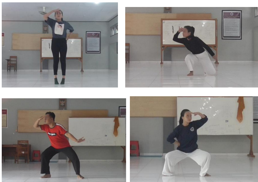
Figure 6. some poses of movement development from the ragam hormat (the gesture of salute), which is the most dominant in students' exploration