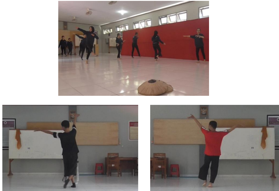
Figure 7. some poses of movement development from exploring the essence of ‘spinning’, which bring the initial articulation of spiritual realm – a sufi dance like

The choreographers are strongly advised to accompany their work with a “choreographic diary” (rather than a ready-read manuscript), which implies the background, improvisational experiences, and artistic tendencies, as well as the attitude to life from which the ideas of their works originate. This is to underline that the human mind and body are one unit, so that a choreographer is not only skilled in moving and dancing, but also able to think reflectively. Within a work process like this, choreographers are able to create artistic and innovative works that can also make meaningful changes for themselves, the community and the environment where they live (Murgiyanto, 2018, p. 256). Although the research does not enforce the ready-made dance piece, each student-participant produces a complete structure of a 7-minute dance presentation. Surely the presentation is a raw model to elaborate in further artistic works, but it is done for now as they show their ‘new’ understanding on the concept of contemporary choreography. Using digital camera and practical editing tool such as CapCut , Power Direct , and Vegas Pro , the student submits their works online.