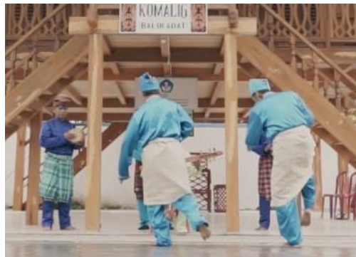
Figure 3. The basic phrase of Dana Dana or ragam dasar , the dominant movement performed at the beginning (opening) and repeated in each transition to the next movement.