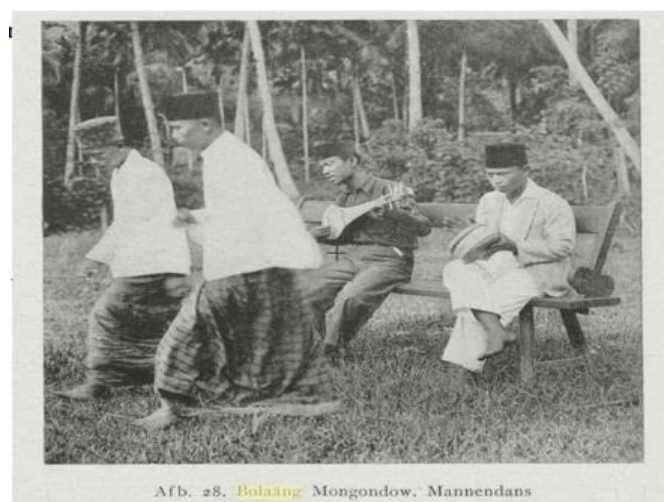
Figure 1. The original presentation of Dana Dana Bolmong , taken by Dr. Kaulder Waltren (Swedish ethnographer) while visiting Bolaang Mongondow around 1913 – 1917 Source: Document of Tegela, Kotamobagu, 2020

To enrich the students’ sight towards the contemporary concept, I direct them to do the improvisation and exploration out-of-door using the gardens and courtyards. It is also to bring their feelings closer to the original context of the presentment of Dana Dana Bolmong . For some reason, only three of the six phrases of the Dana Dana are succesfully explored, as shown by figures below: