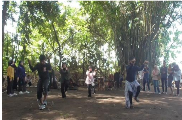
Figure 2. Exploration based on the original presentation of Dana Dana Bolmong in the context of the garden environment as a studio