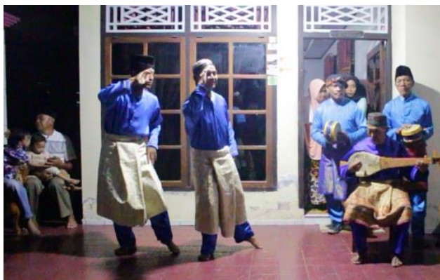
Figure 5. ragam hormat (the gesture of salute), becomes the favorite phrase to explore. This gesture is intended as a symbolic tribute to all whom present and involved in the event.